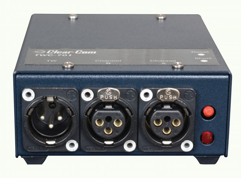
TWC-701 Front panel